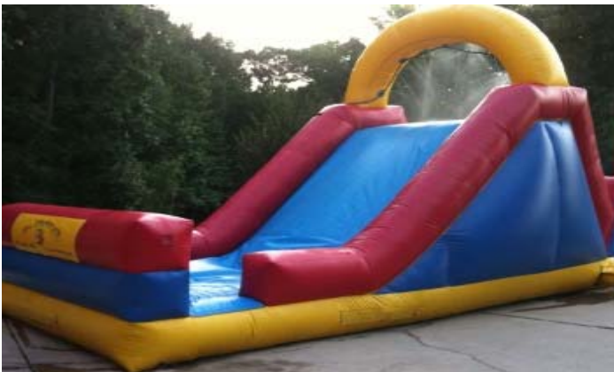
16 Foot Tall Wet/Dry Slide - This one is all business!