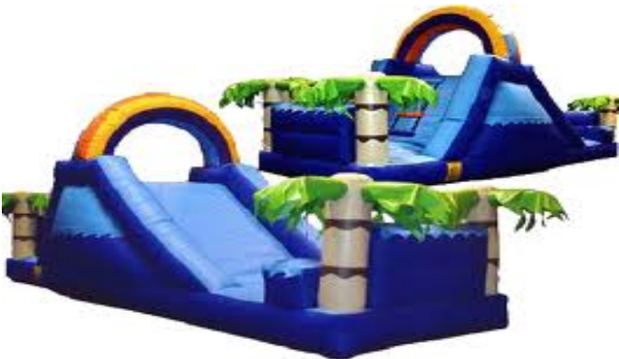
Crowd pleasing 14 Foot Tall Wet/Dry Paradise Slide