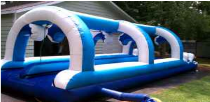
33 Foot Long Slip n' Slide w/ Pool at the end!